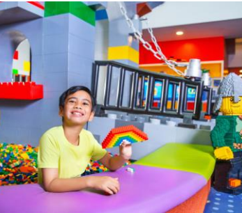
Play with 100,000+ LEGO bricks!