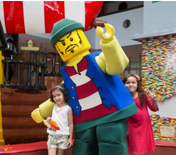
Games and fun in the lobby!