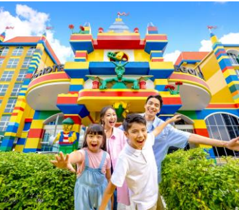
Hunt for treasure and get LEGO rewards!