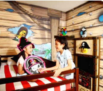
Kids-only space with their own TV!