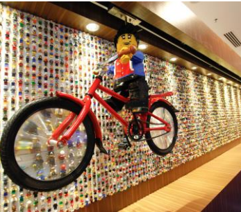
Meet 12,528 mini-figures at check-in!