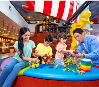
Soar in a knight's castle or set sail!