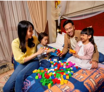
Non stop play with LEGO bricks!