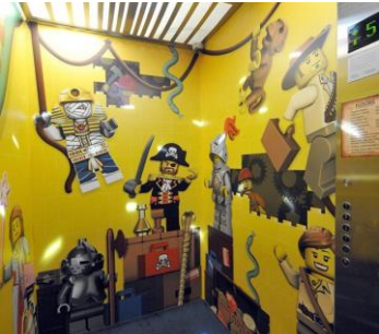
Ride the LEGO disco elevator!