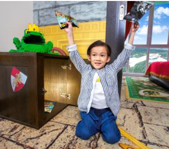
Hunt for treasure and get LEGO rewards!