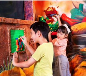
Interactive play walls in rooms!